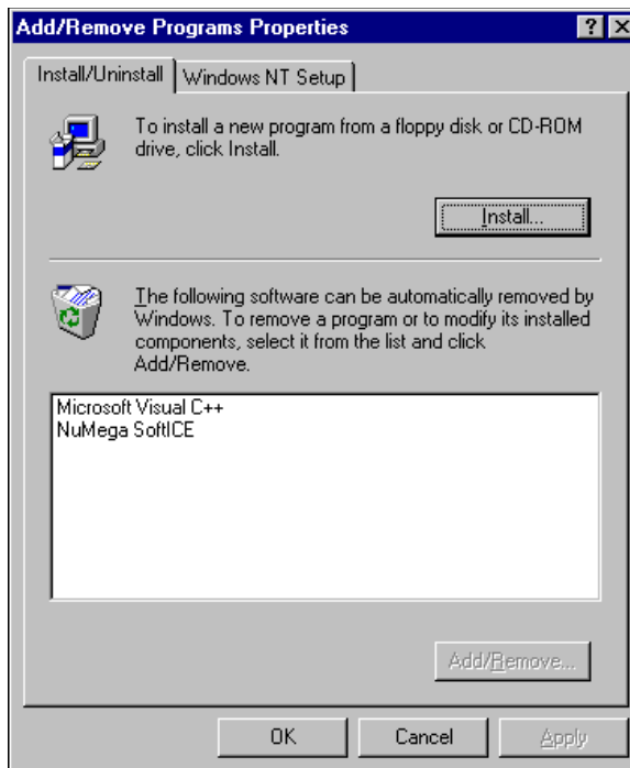
Figure 1-1. Add/Remove Programs Properties Dialog Box

You can use this same applet to uninstall the NI-CAN software at a later time. Refer to Appendix A, Uninstalling the Hardware and Software , in your Windows NT Getting Started manual on the CD for more information.